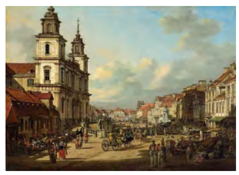
the 1700s-where the Gorzkie Żale was first sung