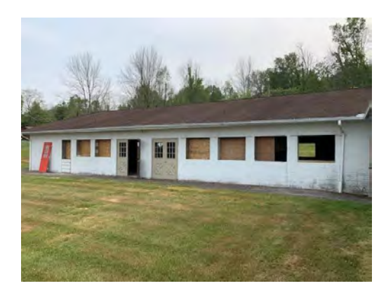
New windows and doors for the dinning pavilion will allow a perfect view of the meadow across the road.