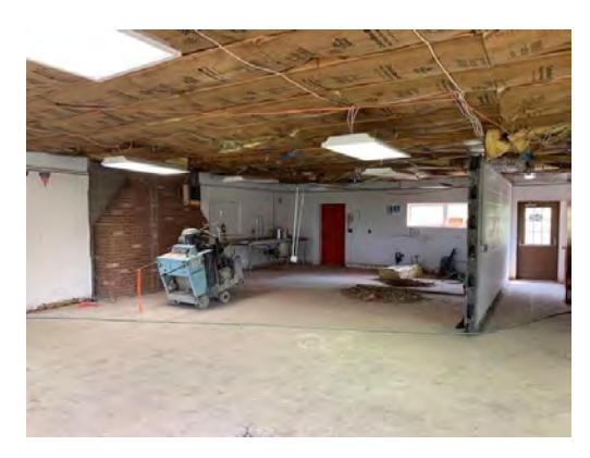
The complete renovation of the interior of the dinning pavilion has been moving forward. Spojnia, Inc. is making the building a four seasons location adding insulation, heat, air conditioning new kitchen, restrooms. All of which will be ADA compliant assisting those with disabilities to attend functions.