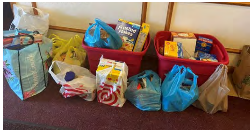
PNU Branch 123 - Holy Trinity Parish - McKees Rocks, PA Donated food to Focus on Renewal in McKees Rocks

Food was donated to the Mount Pleasant PA Food Bank.