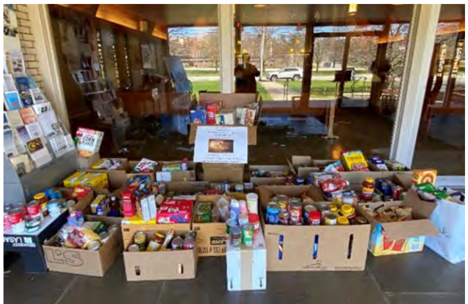
PNU Branch 132 Holy Family Parish McKeesport, PA Food donated to the McKeesport Connection.