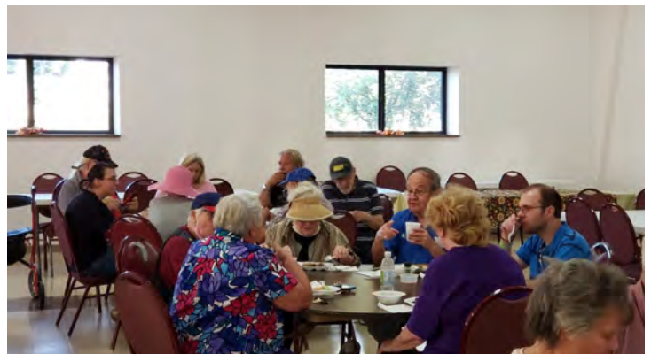
Some of the attendees at One Hot Meal.