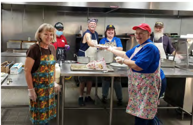
The Kitchen Crew for One Hot Meal